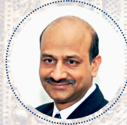
Dr. Rajiv Shah